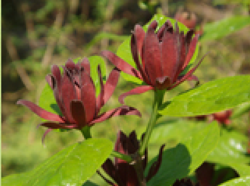
Calycanthus floridus, variety: purpureus, species: "Burgundy Spice"

Deciduous, 6-12 feet tall. Glossy, aromatic, leathery, dark-green foliage. Flowers at ends of branches often very fragrant. Very resistant to disease and insect problems. Prolific suckering habit, adapts to many soils, and grows taller in shaded places.