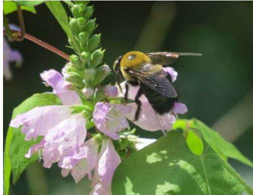
Bee on Obedient Plant