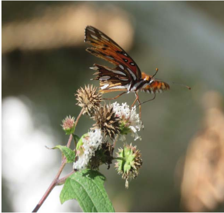
Gulf Fritillary on Salt & Pepper Plant