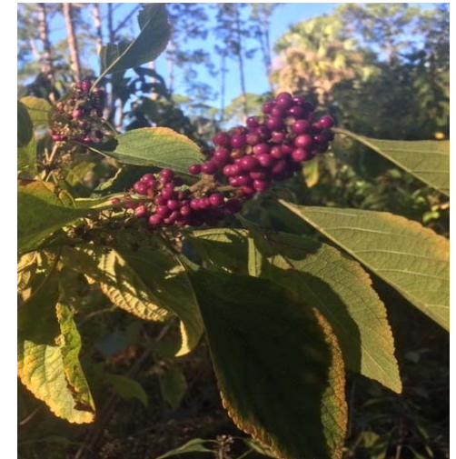
American Beauty Berry

A suggested list of Native Plants that can be grown on Harbor Island, SC