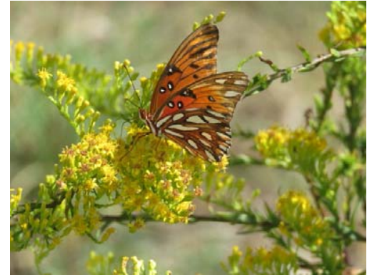
Gulf Fritillary on Seaside Goldenrod