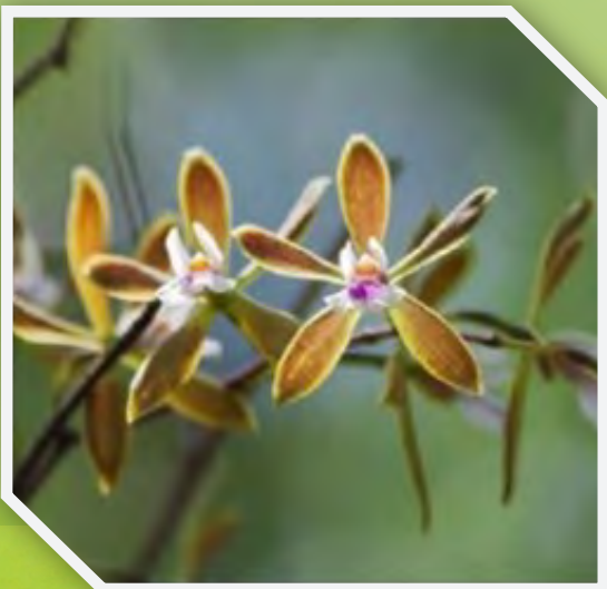
Encyclia tampensis, Florida Native Orchid