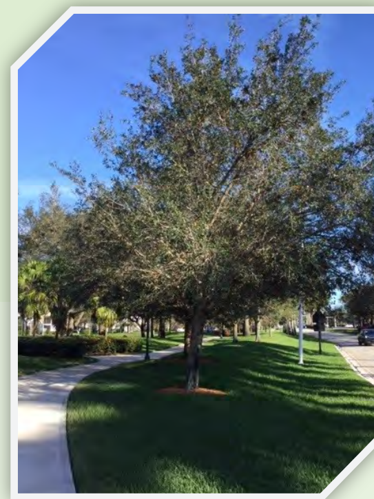
Quercus virginiana, Live Oak

Healthy habitats and healthy communities go hand-in-hand.