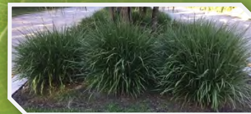
Tripsacum dactyloides, Fakahatchee grass

The City of Weston has committed to supporting native wildlife and plant species by enhancing wildlife-friendly landscapes across Weston and building awareness through community events and educational outreach.