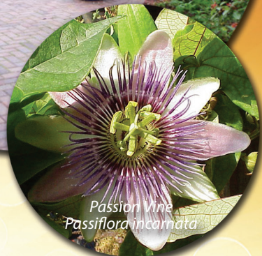
Passion Vine Passiflora incarnata