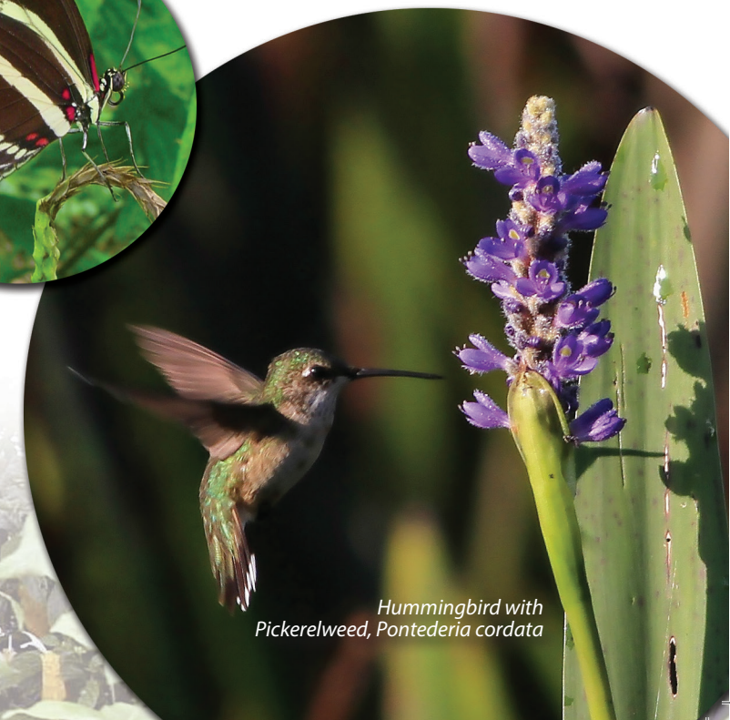
Hummingbird with Pickerelweed, Pontederia cordata