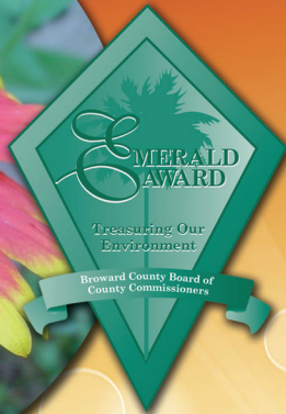
Blánket Flower, Gaillardia pulchella